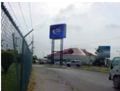
VIDEOBOARD #4 – Portmore Board Located out on the VMBS Perimeter, formally known as Baskin Robbins.