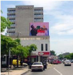
VIDEOBOARD#1 - Knutsford Blvd. Located on the "Hip Strip" on the financial district.