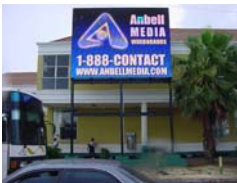
VIDEOBOARD #3 – Montego Bay Located on the LOJ Shopping Center Property, visible from the Sir Howard Cooke Boulevard.