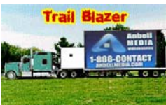
VIDEOBOARD #2 – Mobile Board (Blvd. Super center) Transportable to anywhere in the island